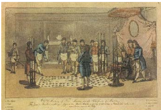
Print of an early 19th century cartoon showing 'A meeting of Freemasons for the admission of Masters'. Grand Lodge museum.