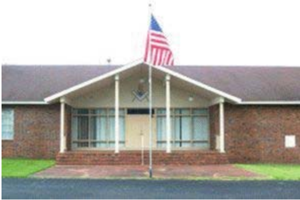
Washington Lodge as it stands today. "Florida's OLDEST Lodge"