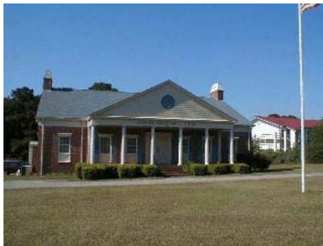
Jackson Lodge as it stands today.

lahassee had petitioned the Grand Lodge of Alabama for a charter. These thirteen had memberships as follows: Six were Tennessee Masons, two were Florida Masons, one from each of Georgia, Mississippi and Indiana, one did not record his previous lodge and the other brother was from Union Mark Lodge of St. Augustine. This would have been the "Mark Masters Lodge" which was chartered by DeWitt Clinton, Grand High Priest of the General Grand Royal Arch Chapter of the United States of America, in 1822. This Mark Masters Lodge was named Union Mark Lodge and met in St. Augustine. I am not including it in this part of our history as one of our pre Grand Lodge, Lodges.