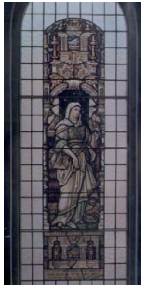
Late 19th century stained glass window depicting the allegorical figure of Charity. Stairwell, Freemasons' Hall.