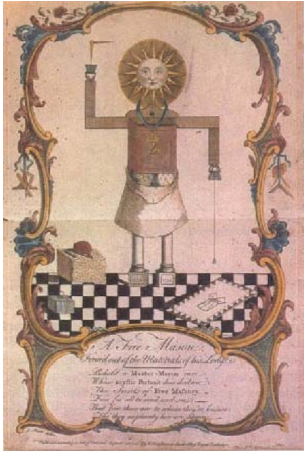
Reproduction of a late 18th century engraving showing 'A Free Mason Formed out of the Materials of his Lodge.'