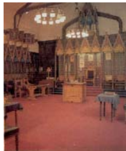
The Grand Chapter of Prince Masons Room, decorated in a mixture of mock Tudor and Gothic styles.