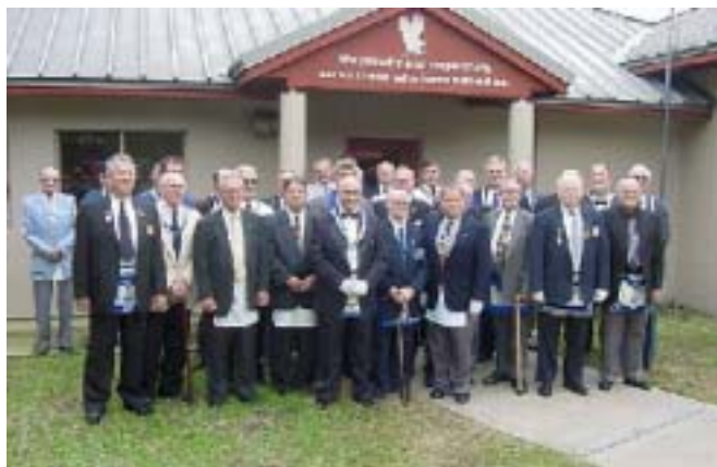
A good showing of Brothers from District 19 were on hand for the presentation.

LECANTO, FL (February 13, 2004) - Thirty-five Masons from the Masters & Wardens Association of the 19th Masonic District of Florida assembled Friday, February 13th, 2004 at Bushnell National Memorial Cemetery to present a picture of George Washington, on behalf of the Most Worshipful Grand Lodge of Free & Accepted Masons of Florida.