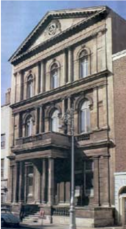
FREEMASONS' HALL Molesworth Street Dublin